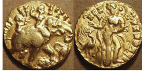
(d) Elephant rider lion slayer of Kumaragupta