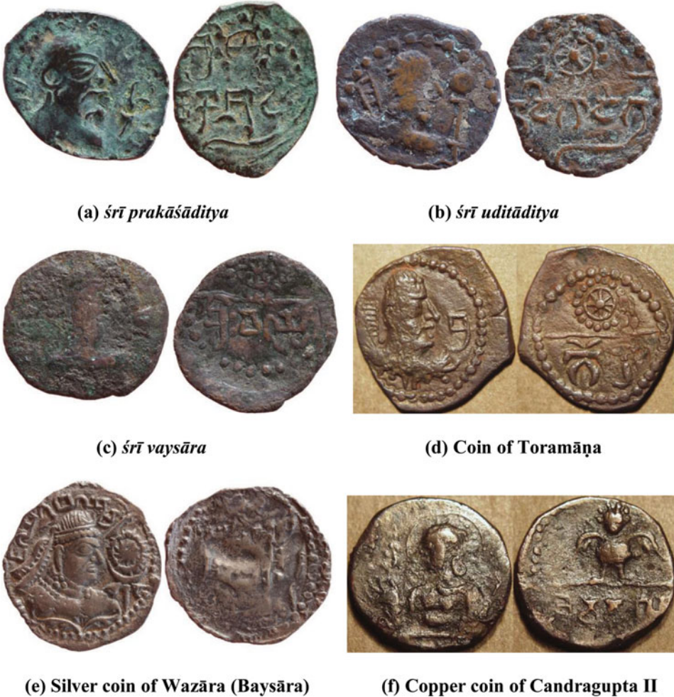
Figure 3. (Colour online) Hun Copper Coins and Related Issues 55

one displaying the dynastic symbol of the king and the lower inscribing his name in Brāhmī letters. Thus it is quite clear that the Huns were drawing inspiration from the Guptas for their Indian coinage.