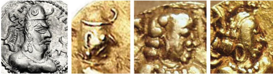
(a) Mehama (b) Prakāśāditya (c) Kumāragupta I (d) Candragupta II