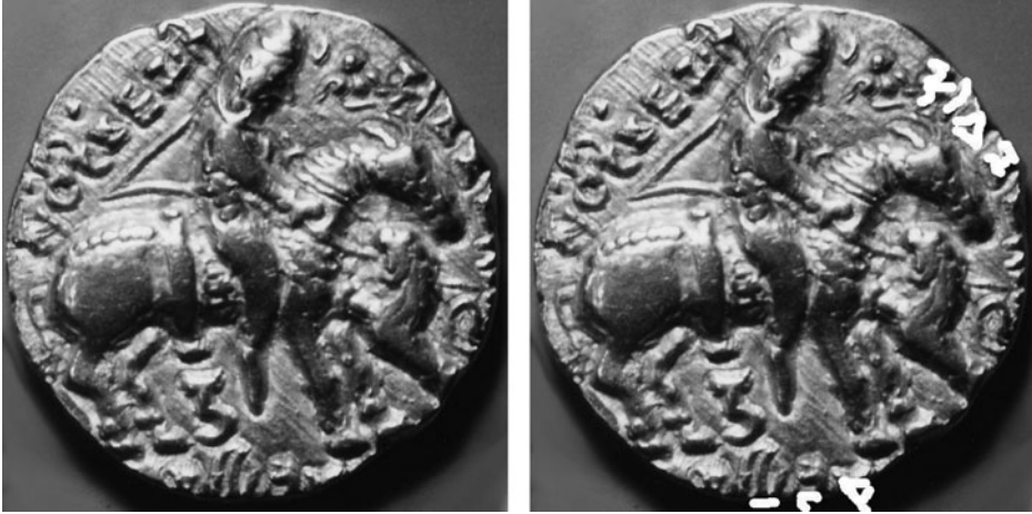
Figure 10. The Patna Museum Coin, with partially restored legend

The Lucknow Museum coin also strongly indicates that the letter following tora is mā and this is consistent with the little bit of the letter visible on the Gemini coin also. However, because of the double-striking on the Lucknow coin, I cannot be absolutely certain of this reading, although I do have a very high degree of confidence in it.