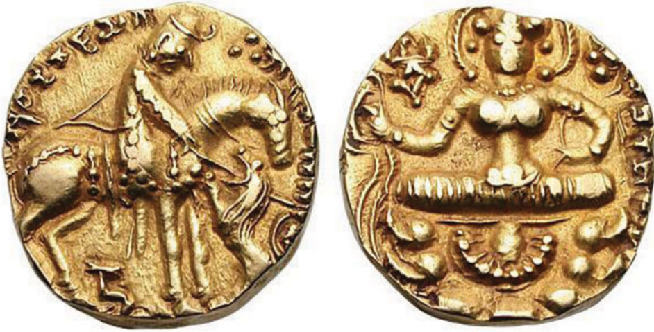
Figure 1. (Colour online) Gold dinar of Prakāśāditya 8

coins, the āditya ending biruda , 9 and even the rough similarity of the obverse design to other Gupta coins, all these factors led to the apparently obvious conclusion that Prakāśāditya must have been a Gupta king. The only question was: Which one? The obverse legend, which would normally reveal the king's name, remained unread for the most part. Only the last part of the legend, ( viji ) tya vasudhām divam jayati , had been read; in particular, no coin with that part of the obverse legend that would contain the king's name had come to light. And there was no clear reference in any literary or epigraphic source to this king Prakāśāditya.