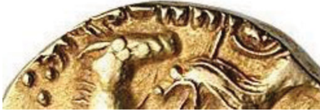
Figure 7. (Colour online) First part of legend on the Browne coin

Bhānugupta. This coin and Shukla's reading have been considered above and it has already been argued that the reading appears to be incorrect.