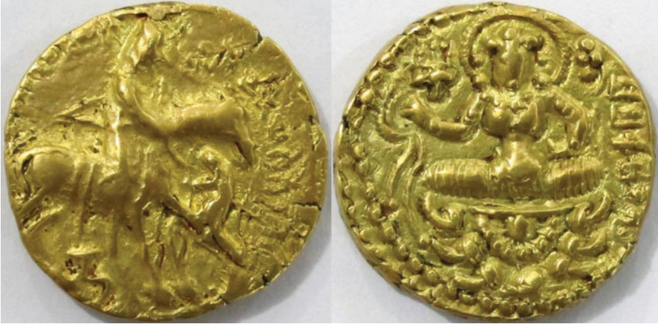
Figure 8. (Colour online) The Lucknow Museum coin, inventory number 6283

coin serves as a check on the entire legend. The reading is consistent with every coin of Prakāśāditya whose photographs I have been able to examine. The reading is: