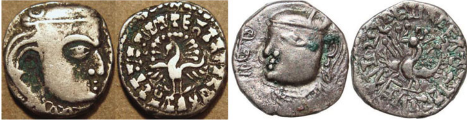
Figure 6. (Colour online) Silver Coins of Skandagupta (left) and Toramāṇa (right) 63