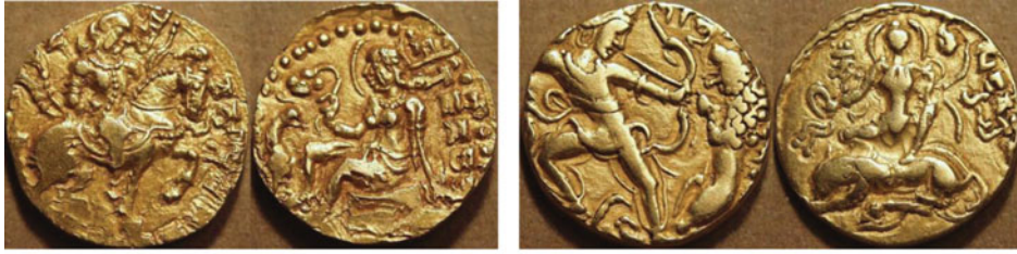
(a) Horseman coin of Candragupta III