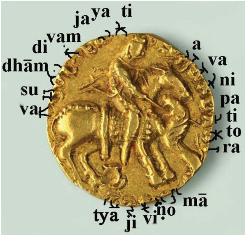
Figure 11. (Colour online) Full legend restored on the National Museum Coin