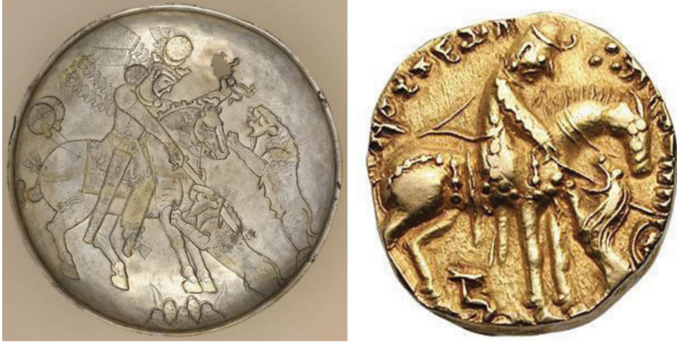
Figure 5. (Colour online) Silver plate 59 of Varahran V compared with Prakāśāditya coin