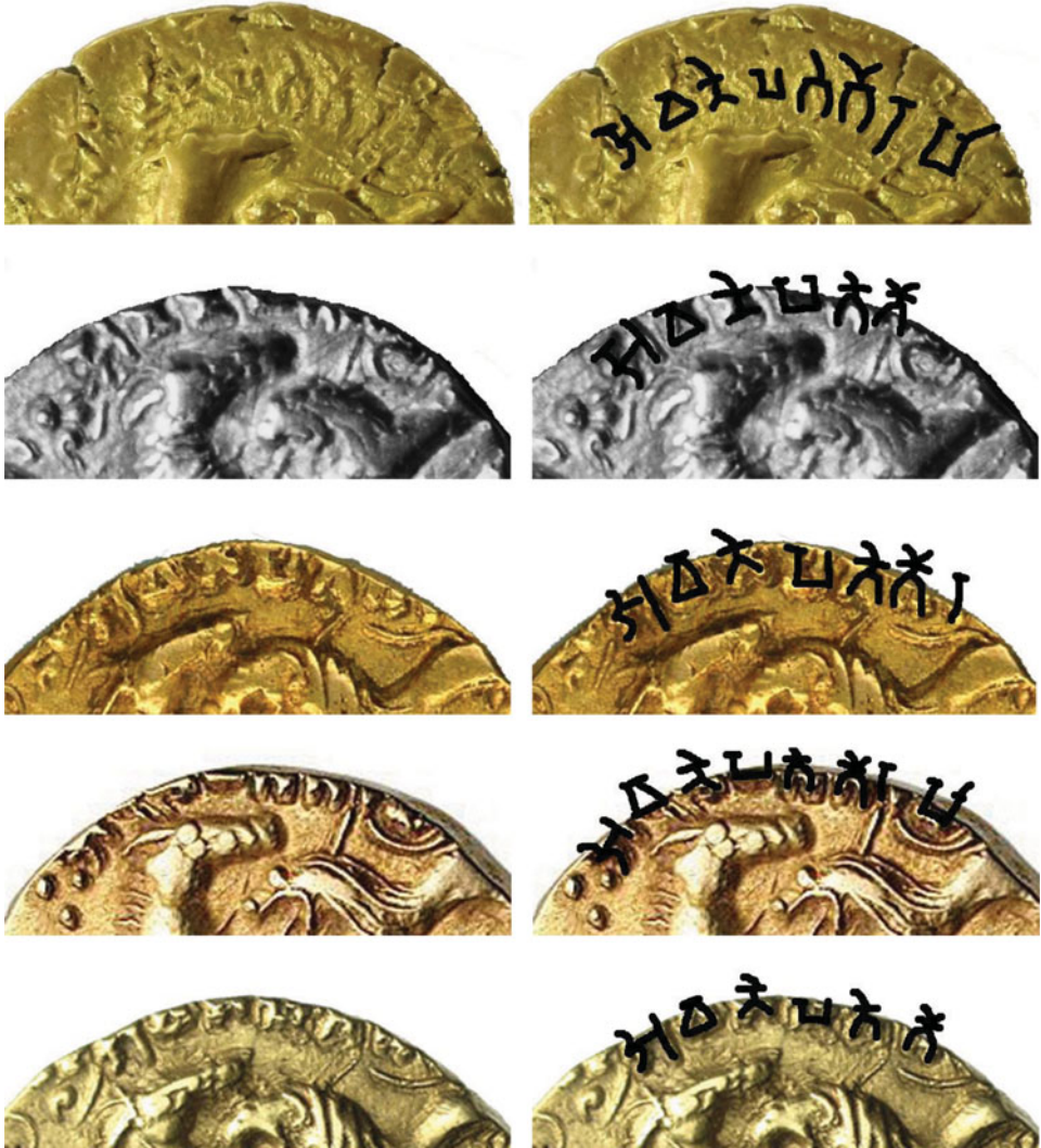
Figure 9. (Colour online) Details of the first part of the legend on 5 coins 71

reading of avanipatitora absolutely certain. On the Lucknow coin, there is a glob of metal above the va that might suggest it needs to be read as vā . However, a close examination reveals that the glob of metal is not part of the original coin design as it does not lie on the same plane as the rest of the legend. My best guess is that it is a droplet of gold that was deposited on the coin during the process of either attaching or removing the loop at 12 o'clock of the coin during its phase as an item of jewelry. The damage caused by that loop can be seen in Figure 8 .